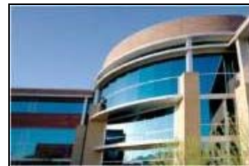
LSI in Scottsdale

In an effort to relieve their life-altering pain, over 8,000 patients have visited LSI for surgery conducted by Dr. James St. Louis' award-winning surgical team. LSI has streamlined the outpatient endoscopic surgical process to be completed in as little as five days. The benefits of LSI's procedures have attracted patients worldwide, from countries such as the United Kingdom, New Zealand, Australia, Guatemala, Dubai, Argentina, Thailand and Spain, to name a few.